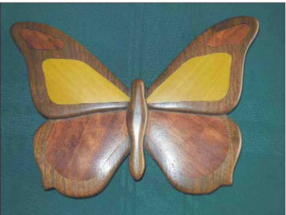
The brown in this intarsia butterfly is walnut, the red is cherry and the yellow is yellowheart wood from Brazil.