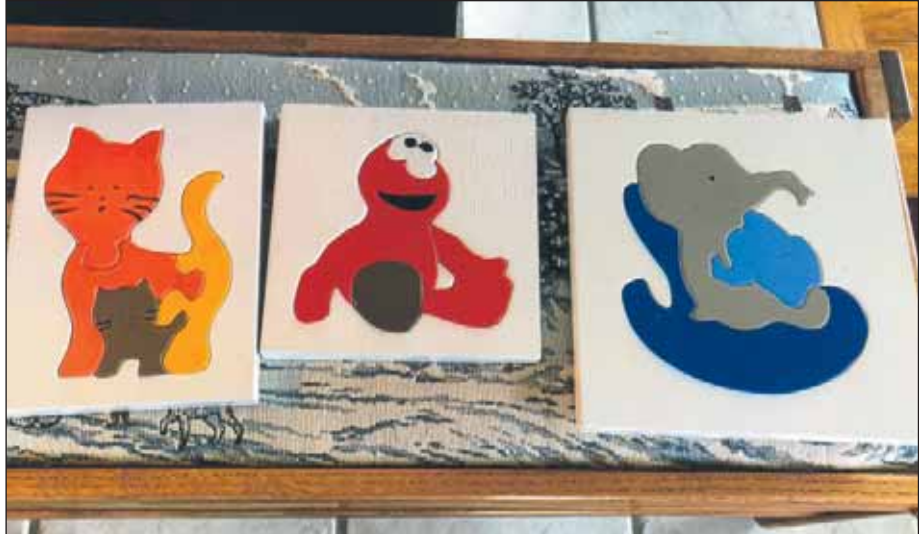
These simple puzzles are fun for little fingers and young minds to work.