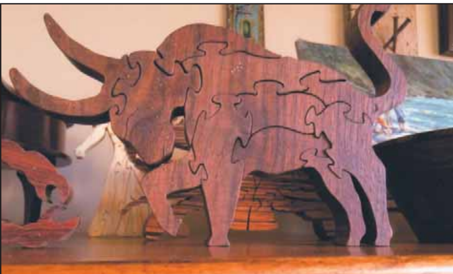
The Taurus zodiac puzzle is made of walnut.