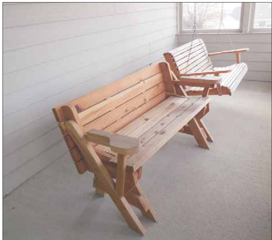
Presto-chango and the beautiful bench turns into a picnic table.