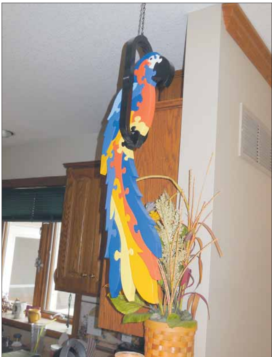
This colorful parrot puzzle hangs from a swing in the Leary home.