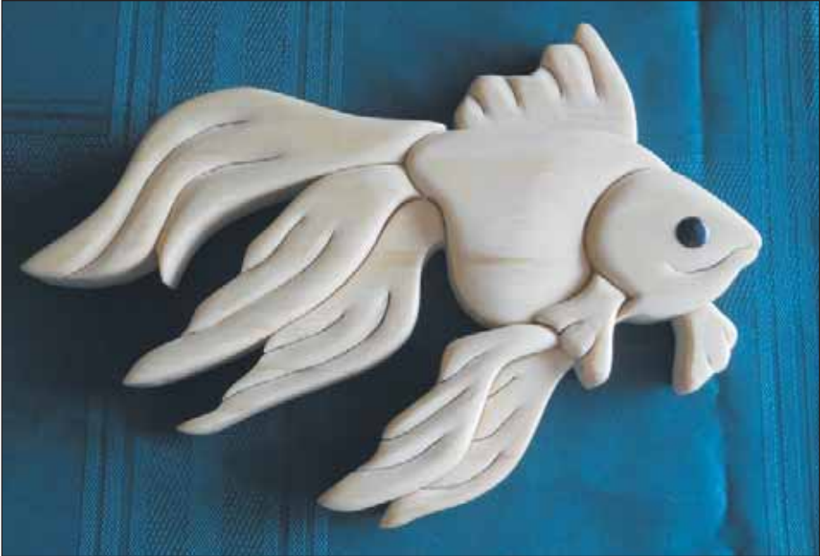
Crafted from maple, this intarsia fish is a beauty.