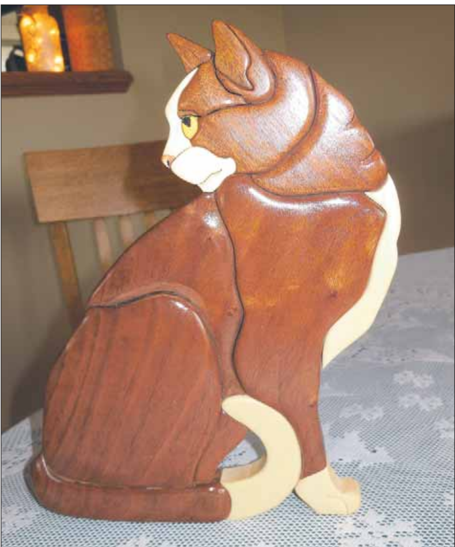
Any cat lover would love this intarsia cat hanging on their wall or standing on a table.