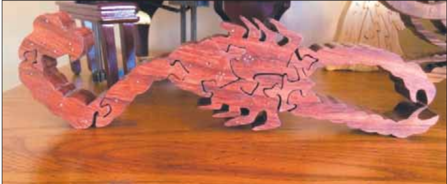
Made of cherry, the gold stars in the Scorpio puzzle are easier to see.