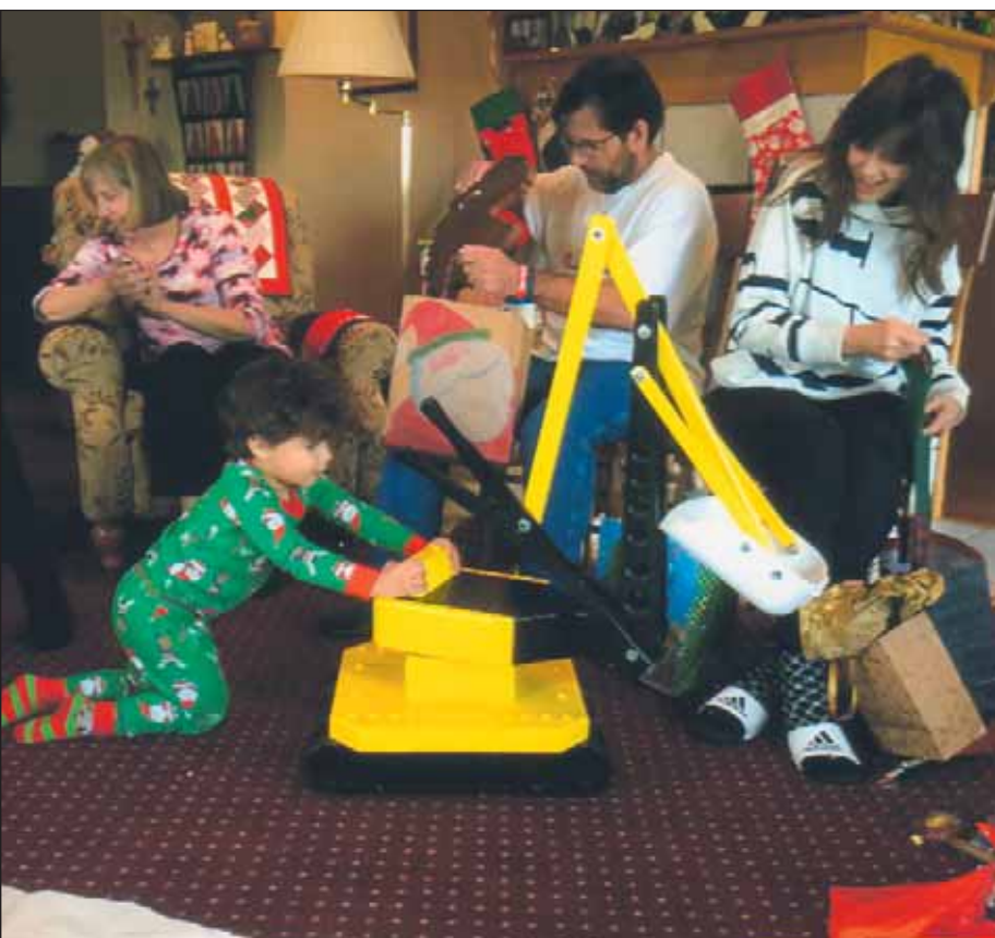
What is more fun for a kid on Christmas than learning to work a new excavator?