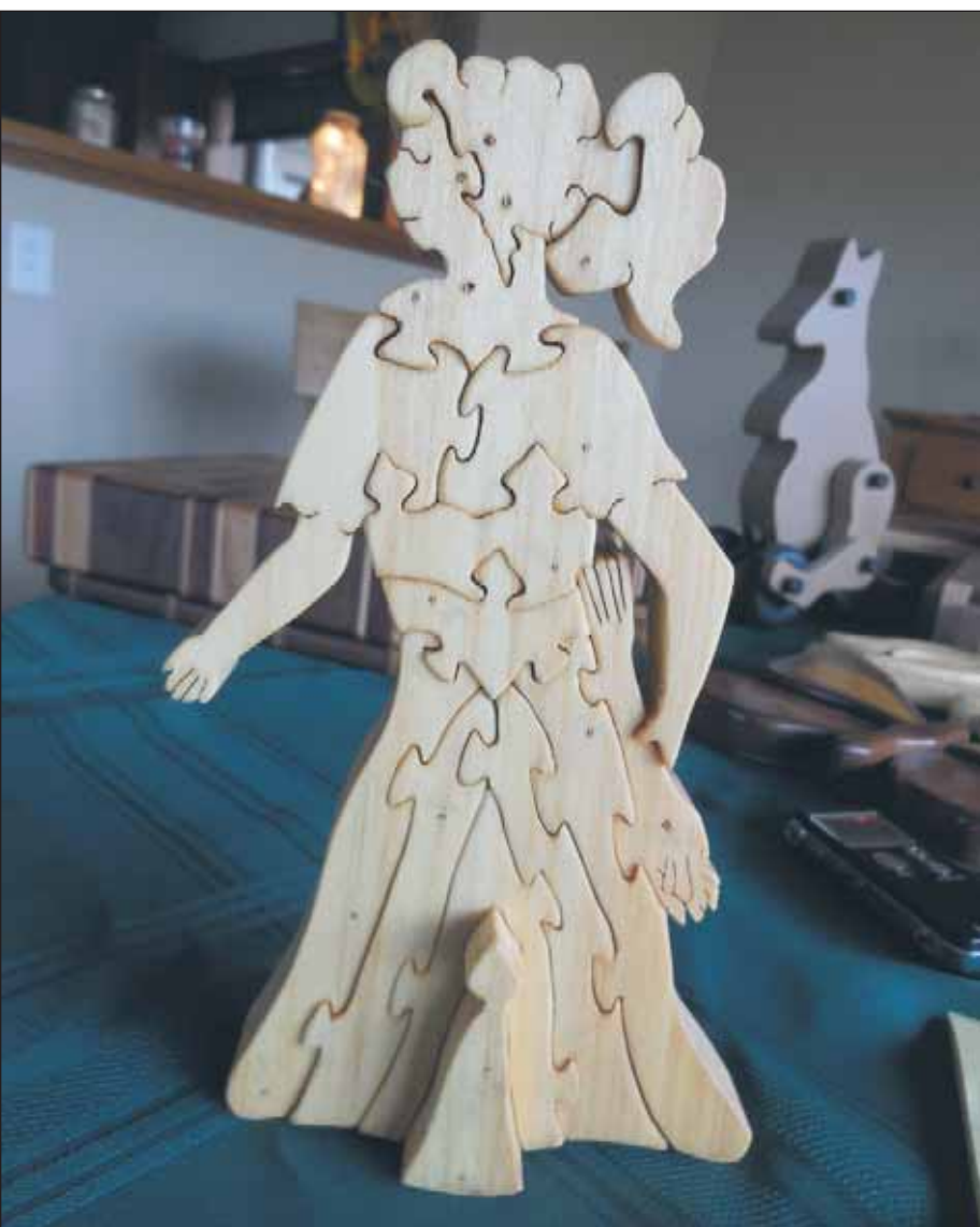
The dots on this puzzle of Virgo are made of tiny gold wires placed in holes which mark the location of stars that comprise the constellation.